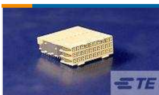
TE Part #2065883-1 Zd Plus, 3 pair receptacle ass