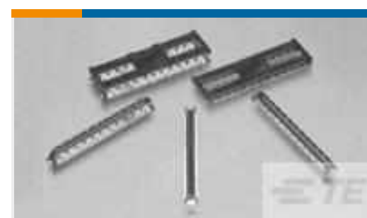
TE Part #3-6318490-6 .5FHR04H,220,S,GIG,08/Sn,HT,NSYes