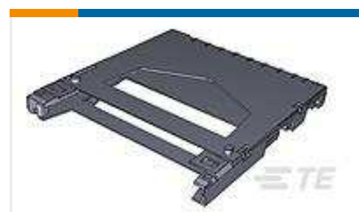
TE Part #1939115-1 SD CONN STD EMBOSS W/B REVERSE