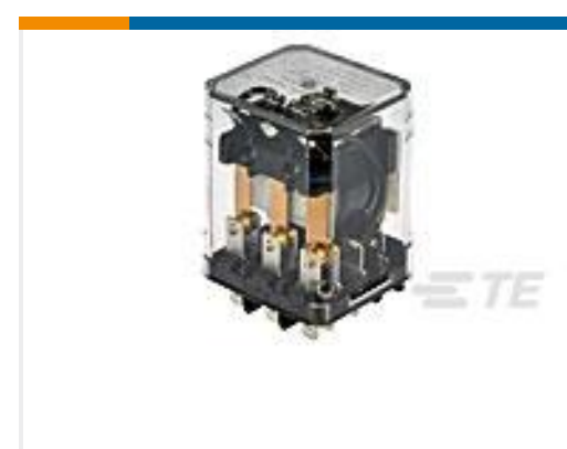
TE Part #1-1393118-4 KUP-14D15-24=KU-