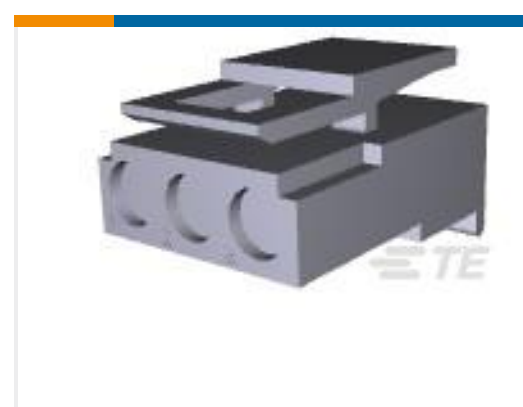
TE Part #1-480721-0 03P CMNL PLUG HSG W/LOK NATL