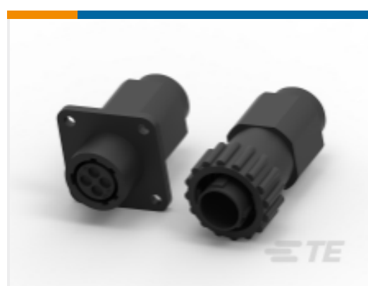
TE Part #796272-1 One-Piece Connector, Sealed, CPC Series 1