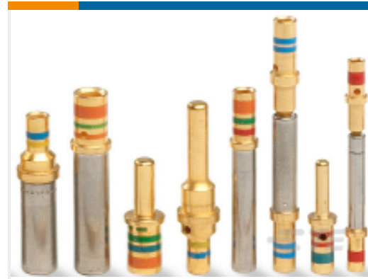
TE Part #ZPF0000000000001964 182-0400-16