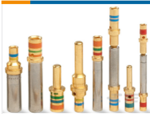
TE Part #ZPF000000000000355 006-0937-12