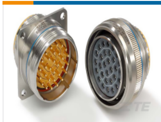
TE Part #ZPF100000000000147041 983-15 SE 7-18-08 PN-L-A1499