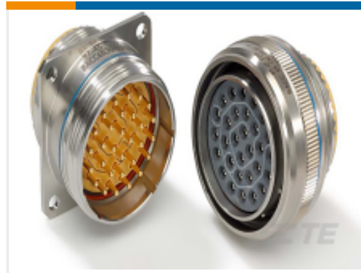
TE Part #ZPF0000000000009080 983-6W 18-08 SN-L