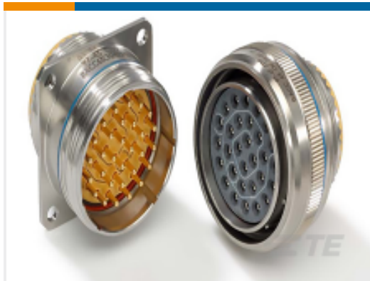
TE Part #ZPF10000000000036992 983-6SE 16-10 S6 L