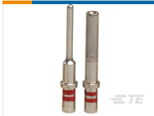
TE Part #ZPF0000000000001920 182-0068-20