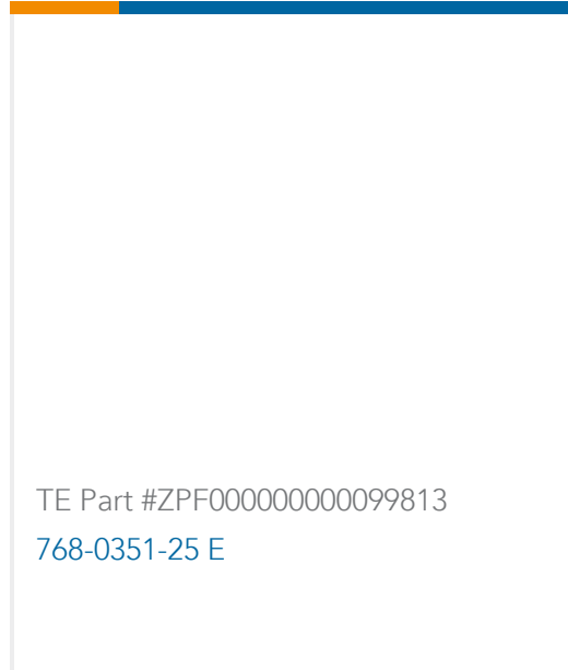
TE Part #ZPF00000000000099813 768-0351-25 E