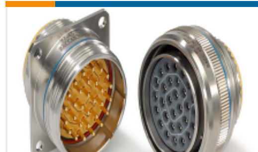
TE Part #ZPF000000000008061 983-6K 08-03 S6