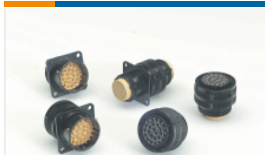
TE Part #ZPF000000000019140 FDDBA 56-12-10 SN-K