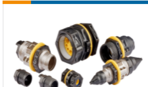
TE Part #ZPF0000000000137412 D-EASY 03 B 05