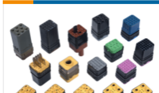
TE Part #ZPF0000000000114466 DMC-M 22-07 BN