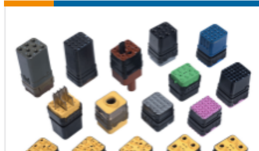
TE Part #ZPF000000000015248 DMC-M 12-20 AA