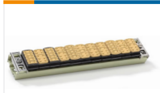
TE Part #ZPF0000000000020148 FMJ 11E 20-04 G