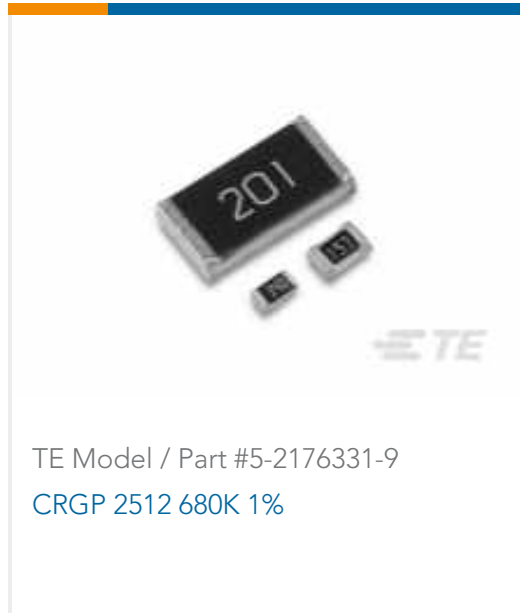
TE Model / Part #5-2176331-9 CRGP 2512 680K 1%