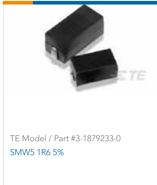
TE Model / Part #3-1879233-0 SMW5 1R6 5%