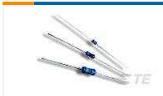
TE Model / Part #1879026-7 YR1 0.1% 11R8