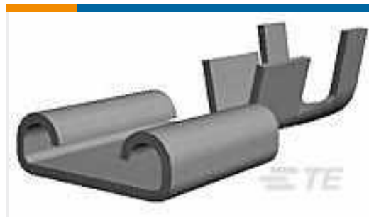
TE Model / Part #181903-1 FASTON 250 RECEPTACLE 1.0-2.5 MM2 TPBR