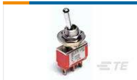
TE Model / Part #1-1825138-8 A201SD9AV2Q04