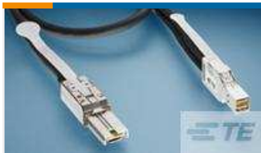
TE Model / Part #2202508-2 C/A, 4X MINISAS HD TO MINISAS, 28AWG, 1M