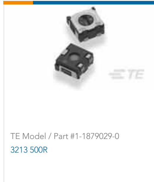
TE Model / Part #1-1879029-0 3213 500R