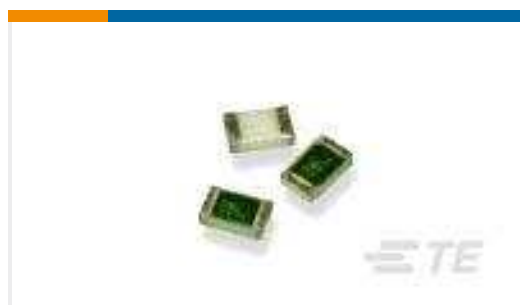
TE Model / Part #5-1879335-8 CPF 0603 84R5 1% 50PPM 1K RL