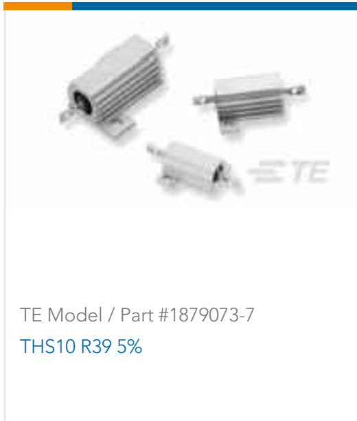
TE Model / Part #1879073-7 THS10 R39 5%