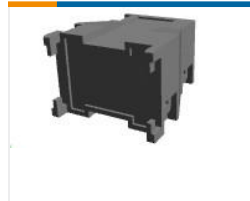
TE Part #207088-1 METRIMATE, STR REL KIT, 24P