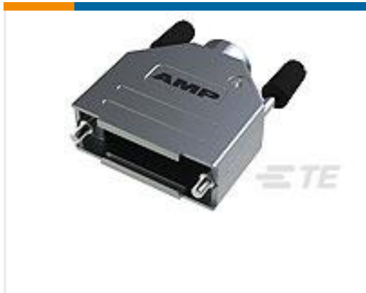
TE Part #5-1478762-2 Metal backshell 15 way Top Entry-KIT