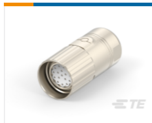
TE Part #ASA558N00610235000 623 PLUG