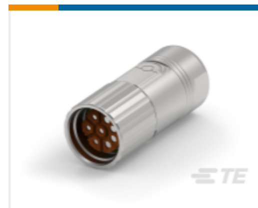
TE Part #BSA108N00590236000 923 PLUG, SHORT