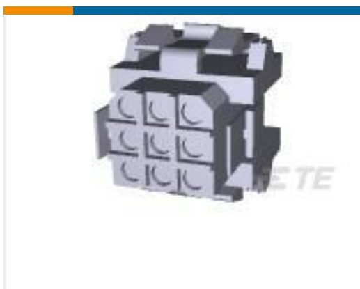
TE Part #207439-1 9 POS SQ GRID METRIMATE-PLUG