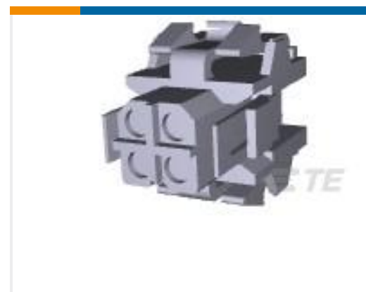
TE Part #207015-1 HSG, PLUG, 4 POSN, SM METRIC