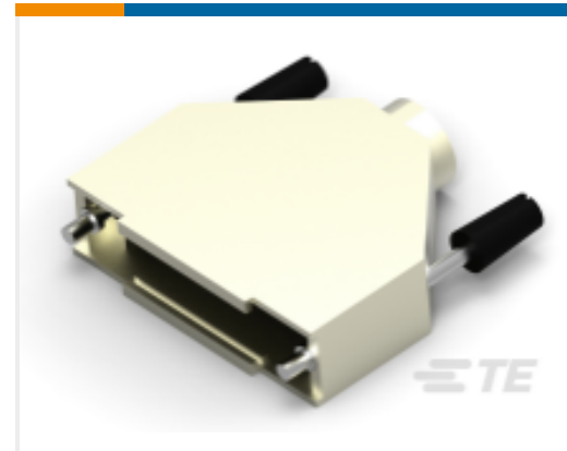
TE Part #5-1478762-3 Metal backshell 25 way Top Ent