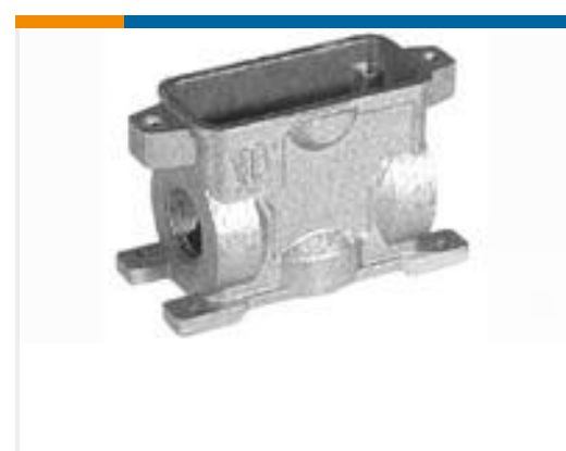
TE Part #1106461-7 EMVK24STO1M25+1M32G