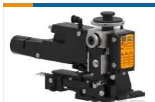
TE Model / Part #2836775-2 OCEAN_2.0_Applicator-S-217F323OV