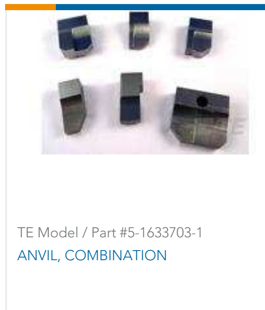
TE Model / Part #5-1633703-1 ANVIL, COMBINATION