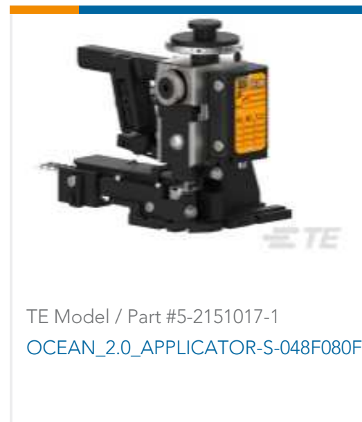
TE Model / Part #5-2151017-1 OCEAN_2.0_APPLICATOR-S-048F080F