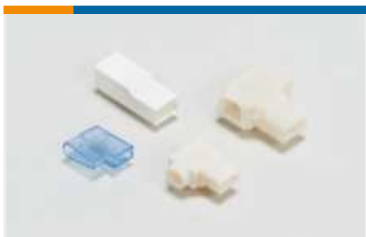
Crimp Terminal Housings(17)