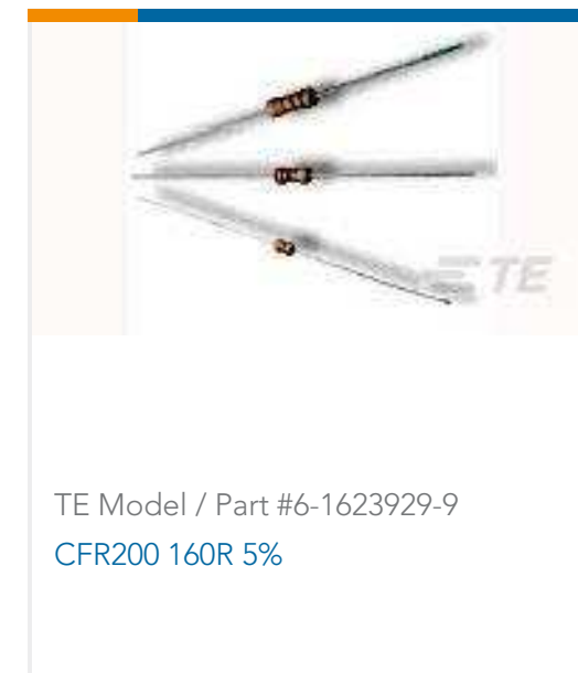
TE Model / Part #6-1623929-9 CFR200 160R 5%