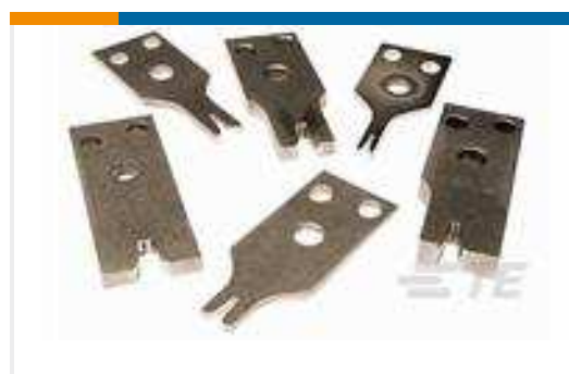
TE Model / Part #1633609-2 CRIMPER, WIRE "F" .039