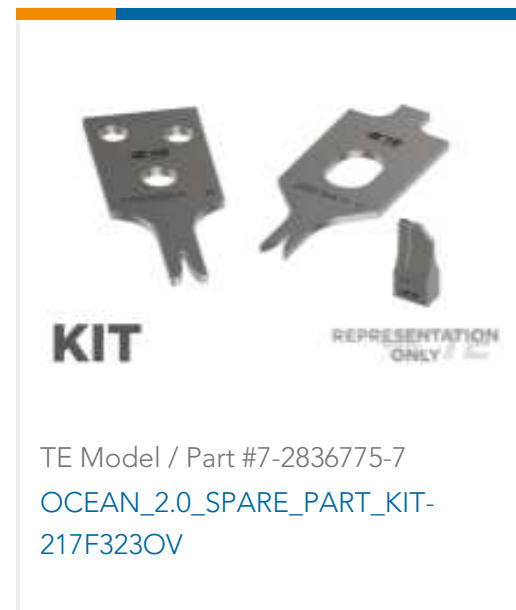
TE Model / Part #7-2836775-7 OCEAN_2.0_SPARE_PART_KIT- 217F323OV