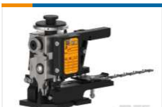
TE Model / Part #2150490-1 OCEAN_2.0_Applicator-E-110F150OV