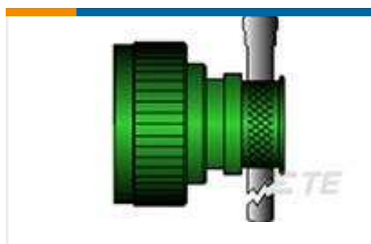
TE Model / Part #EF8841-000 BND40AC00-2416A