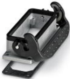
HEAVYCON B16 panel mounting base, with single locking latch, height: 29 mm, with flat gasket

Please be informed that the data shown in this PDF Document is generated from our Online Catalog. Please find the complete data in the user's documentation. Our General Terms of Use for Downloads are valid ( http://phoenixcontact.com/download )