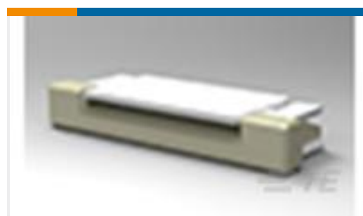
TE Part #1-1734839-6 FPC CONN. 0.5MM PITCH T/C,16P