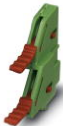
Ejectors, for assembly on each side of the header

Please be informed that the data shown in this PDF Document is generated from our Online Catalog. Please find the complete data in the user's documentation. Our General Terms of Use for Downloads are valid ( http://phoenixcontact.com/download )