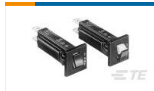
TE Part #4-1393250-0 W28-XQ1A-7=W28