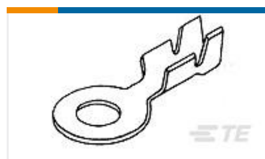
TE Part #42547-2 RING 26-22 AWG TPBR