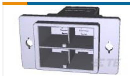
TE Part #2-917809-2 DYNAMIC D-5 TAB HSG D/R 4P Y-Y