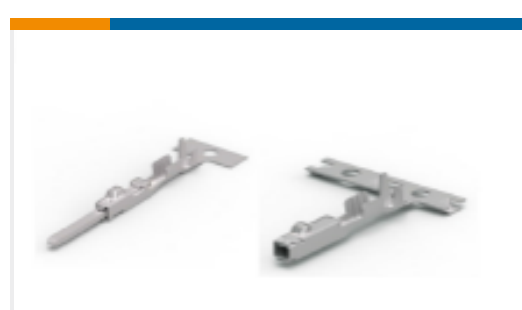
TE Part #2141114-3 MCON Receptacle and Tab