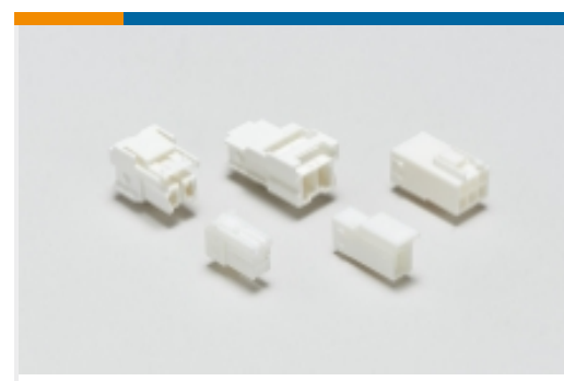
Rectangular Power Connectors(27)