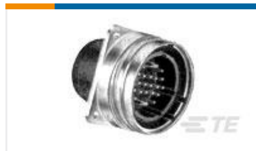
TE Part #1776088-1 CMC RECEPT ASSY,SIZE 28-16