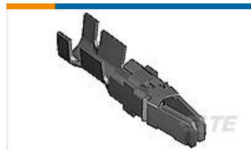
TE Part #66741-2 TYPE XII FEMALE CONT (L.P.)