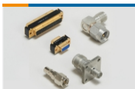
Connector Adapters & Connector Savers(10)