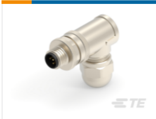
TE Part #T4113411051-000 M12 M, 5P GOLD B_CODE RA SHIELDED PG7