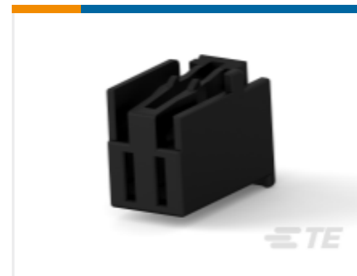
TE Part #281871-3 5MM PITCH TAB/RECT CONN