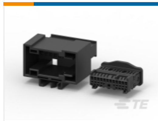
TE Part #1-962692-2 MQS, CONNECTOR HOUSING