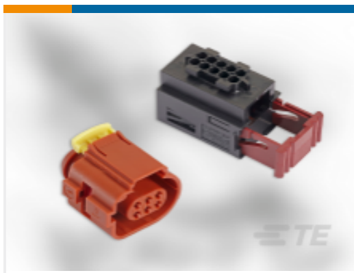
TE Part #1-968307-2 Timer Connector Housing