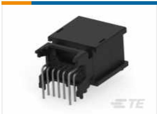
TE Part #4-2177372-3 8POS,TAB 0.5X0.4,HEADER ASSY, CODA