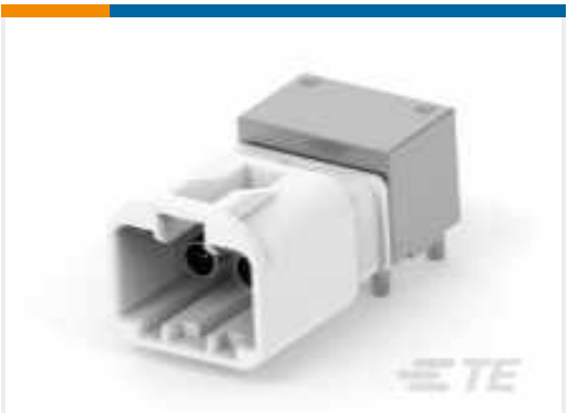
TE Part #2306368-2 2POS,MATE-AX,HDR ASSY,90DEG, COD B