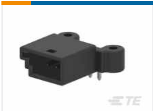
TE Part #1-1355154-1 SIGNAL HEADER