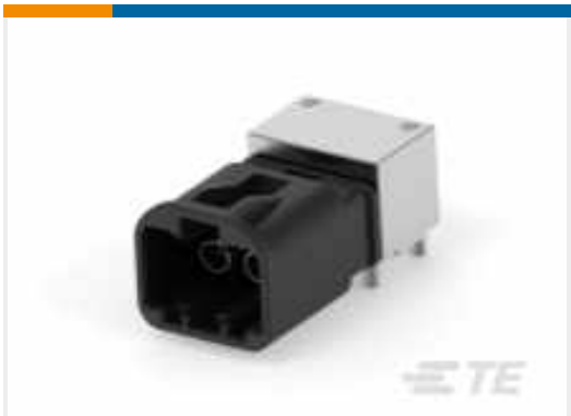
TE Part #2306368-1 2POS,MATE-AX,HDR ASSY,90DEG, COD A