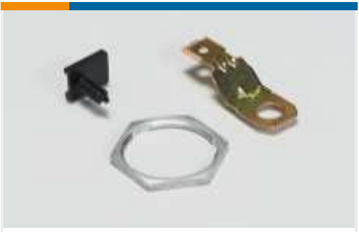
Other Automotive Connector Accessories(13)