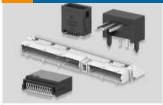
PCB Headers & Receptacles(209)