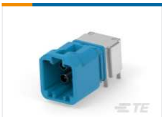
TE Part #2321775-3 4POS,MATE-AX,HDR ASSY,90DEG, COD C