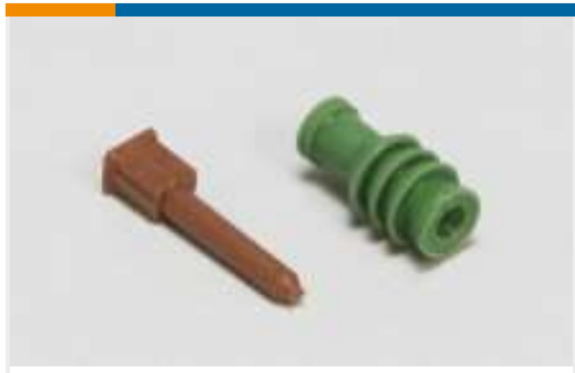
Automotive Seals & Cavity Plugs(26)