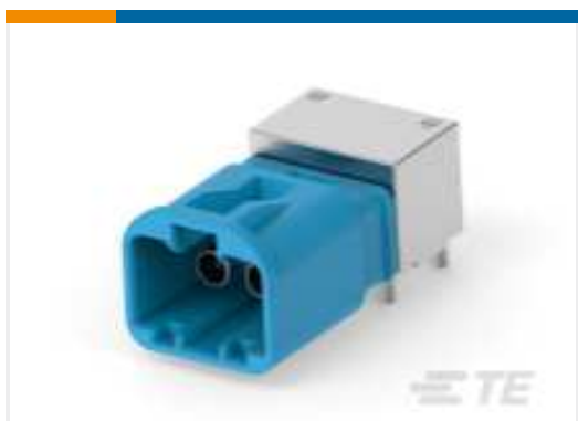
TE Part #2306368-3 2POS,MATE-AX,HDR ASSY,90DEG, COD C