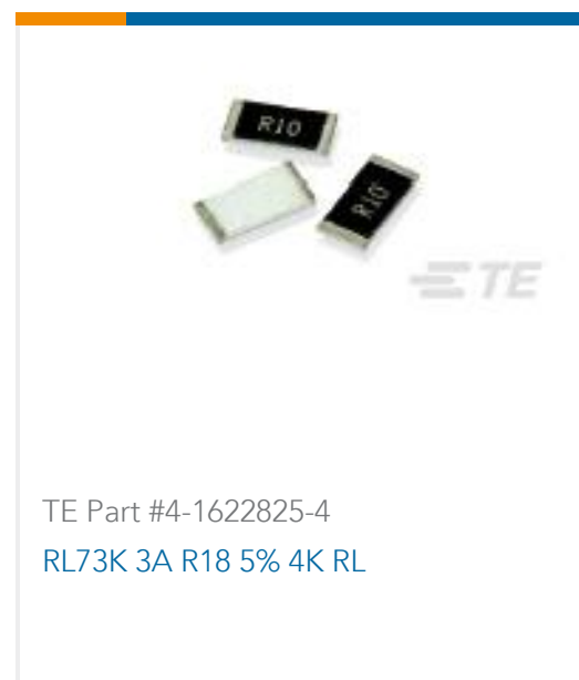
TE Part #4-1622825-4 RL73K 3A R18 5% 4K RL