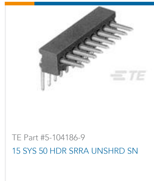
TE Part #5-104186-9 15 SYS 50 HDR SRRA UNSHRD SN