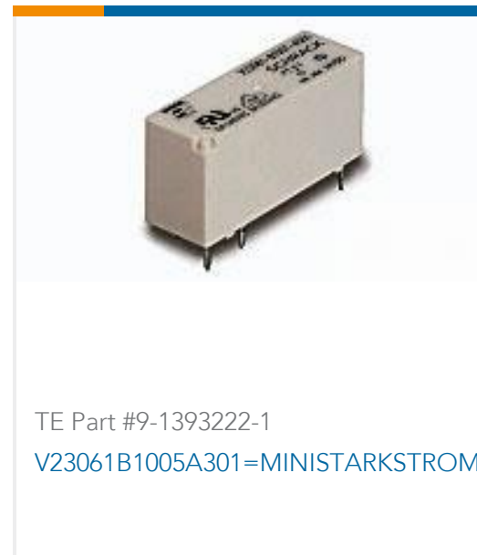
TE Part #9-1393222-1 V23061B1005A301=MINISTARKSTROM