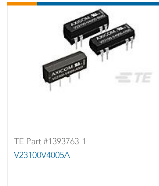
TE Part #1393763-1 V23100V4005A