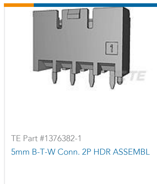
TE Part #1376382-1 5mm B-T-W Conn. 2P HDR ASSEMBL