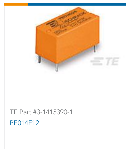
TE Part #3-1415390-1 PE014F12