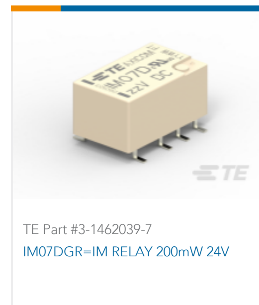
TE Part #3-1462039-7 IM07DGR=IM RELAY 200mW 24V