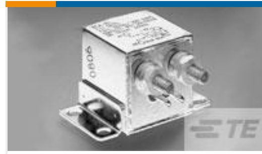
TE Part #9-1617806-7 FCA-150-KY4=50 AMP 1PST/NO DM RELAY