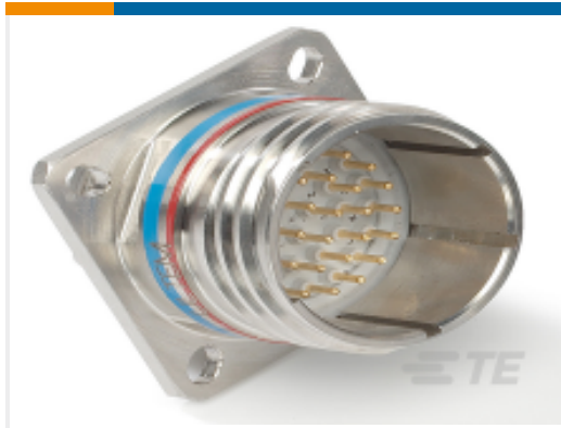
TE Part #YDTS20W25-43SCV001 RECP ASSY