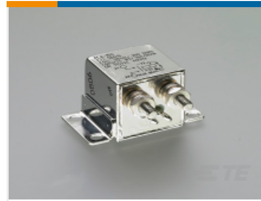
TE Part #5-1617800-8 FCAC-150-KY4=50 AMP MID RANGE RELAY