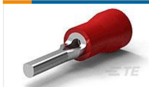
TE Part # 165143 PG WIRE PIN 22-16