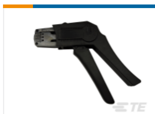
TE Part # DTT-20-00 CRIMP TOOL