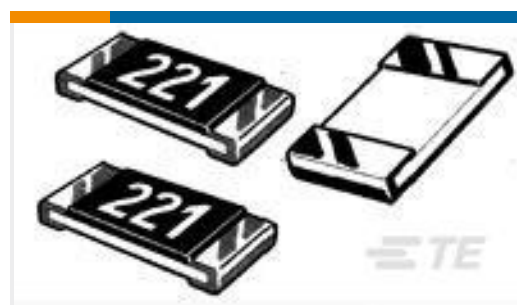
TE Part # 1622820-1 3520 100K 5%