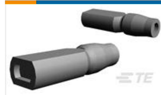
TE Part # 1-170823-8 250 FASTON SLEEVE, REC., TRANSPARENT