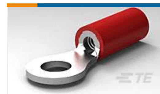
TE Part # 170780-1 P.G RING UL.CSA(22-18)