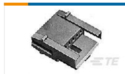
TE Part # 172211-4 EIS CAP HSG FREE HANG 4P NATUTURAL