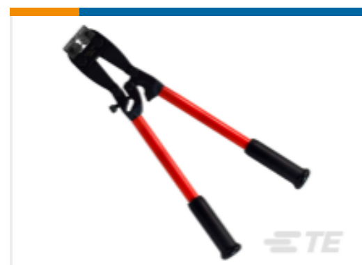
TE Part # HDT-04-08 CRIMP TOOL, HDT-04-08