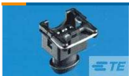
TE Part #347887-3 2 WAY JUNIOR TIMER CONN.