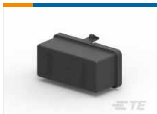
TE Part #109854-1 COVER WITH SEAL