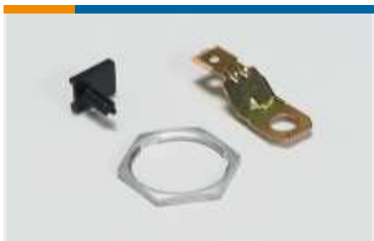
Other Automotive Connector Accessories(13)