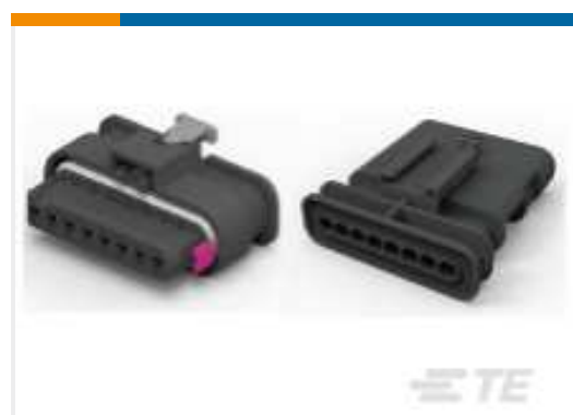
TE Part #1-2236343-1 MCON Connector Housing