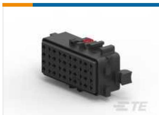
TE Part #1587335-1 BASE ASSEMBLY, 40 POSITION