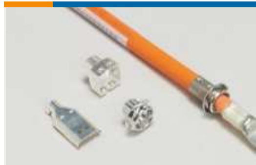
Automotive Connector EMC Shielding (2)