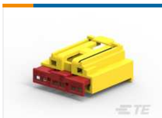
TE Part #1564003-1 6POS,GET 0.64,REC HSG,ASSY