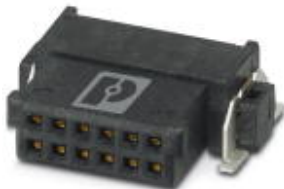
The figure shows a 12-pos. version with 12 contacts

SMD female connector, Nominal current at 20 °C: 1.4 A, Test voltage: 500 V AC, number of positions: 16, pitch: 1.27 mm, color: black, contact surface: Gold, mounting: SMD soldering