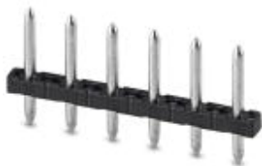
The figure shows a 6-position version

Pin strip, nominal current: 12 A, number of positions: 4, pitch: 5 mm, color: black, contact surface: Tin, The maximum current depends on the plug used. The lower of the two current values apply for plug and pin strip. The pin strip is made of highly temperature resistant plastic and is thus suitable for the reflow process.