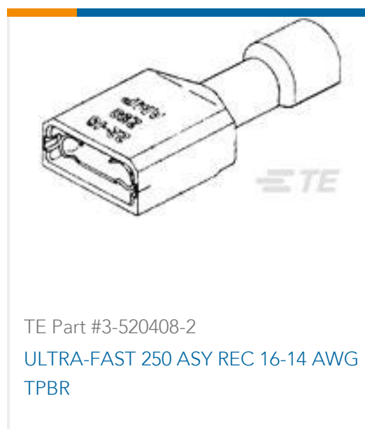
TE Part #3-520408-2 ULTRA-FAST 250 ASY REC 16-14 AWG TPBR