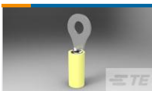
TE Part #320634 TERMINAL,PIDG R 12-10 6