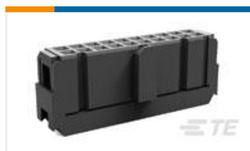
TE Part #1658621-9 40 NOVO MIL/CTR 15DP,LEAD FREE