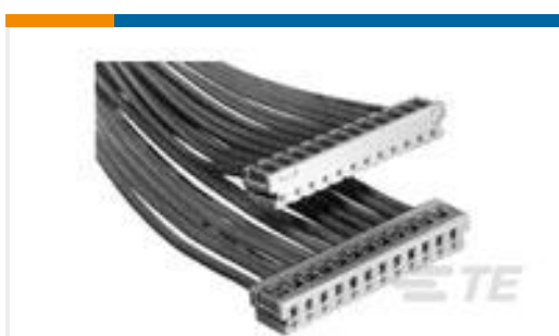
TE Part #179228-4 CT CRIMP-2 REC HSG 4P NATURAL