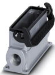
Box mounting base, with single locking latch, height 84 mm, without screw connection, 1x Pg29

Please be informed that the data shown in this PDF Document is generated from our Online Catalog. Please find the complete data in the user's documentation. Our General Terms of Use for Downloads are valid ( http://phoenixcontact.com/download )