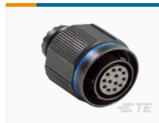
TE Part #YDTS26T09-35SAV001 PLUG ASSY