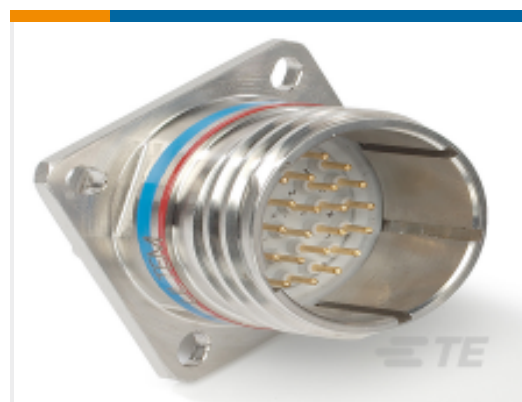
TE Part #YDTS20W11-98PAC001 D38999: Square Flange, 11-98 insert