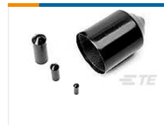
TE Part #843052-000 101A052-3-0