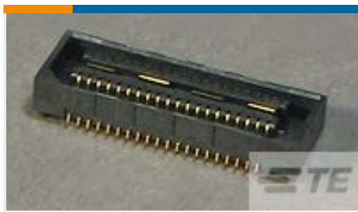
TE Part #1658462-1 MSB0.80RC-ASY040FL,-,30,-TY