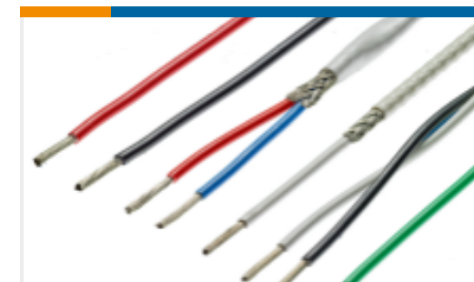
TE Part #143109-000 44AM1121-26-9/96-9CS2275