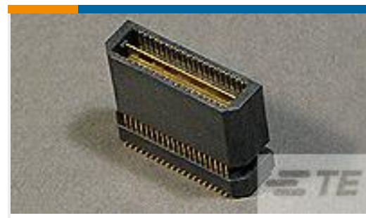
TE Part #1658016-1 MSB0.80PL16ASY040FL, -, 10, -TY