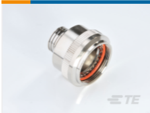
TE Part #70H1-11-04-1-B 70H1-11-04-1-B