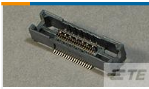
TE Part #5767096-8 MICT, REC, 038, ASY, .025, TAPE, CAP