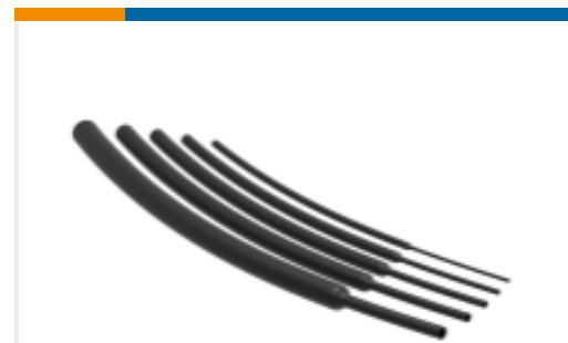
TE Part #NB18742001 RNF-100-1/16-BK-STK