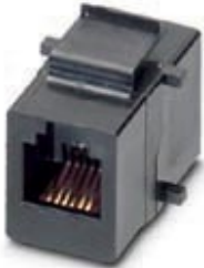
Socket insert RJ11, modular system (Keystone), 6-pos., unshielded

Please be informed that the data shown in this PDF Document is generated from our Online Catalog. Please find the complete data in the user's documentation. Our General Terms of Use for Downloads are valid ( http://phoenixcontact.com/download )