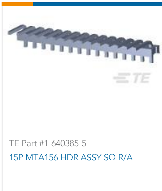
TE Part #1-640385-5 15P MTA156 HDR ASSY SQ R/A