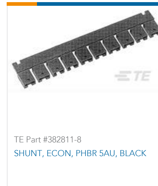
TE Part #382811-8 SHUNT, ECON, PHBR 5AU, BLACK /LOCK