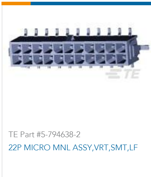
TE Part #5-794638-2 22P MICRO MNL ASSY, VRT, SMT, LF