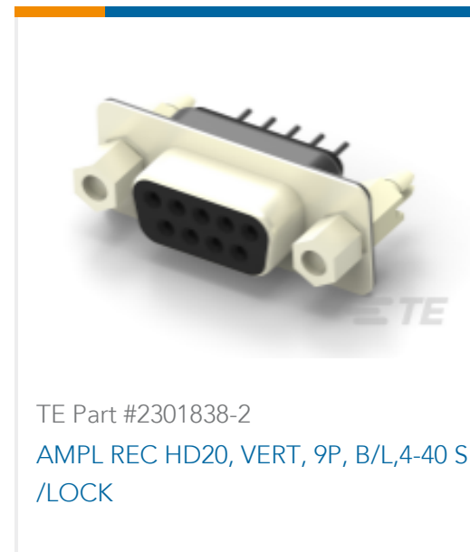
TE Part #2301838-2 AMPL REC HD20, VERT, 9P, B/L, 4-40 S /LOCK