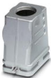
HEAVYCON sleeve housing B6, for single locking latch, height 70 mm, with thread M32, straight cable outlet, EMC version

Please be informed that the data shown in this PDF Document is generated from our Online Catalog. Please find the complete data in the user's documentation. Our General Terms of Use for Downloads are valid ( http://phoenixcontact.com/download )