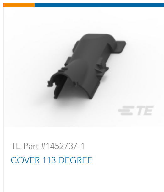
TE Part #1452737-1 COVER 113 DEGREE