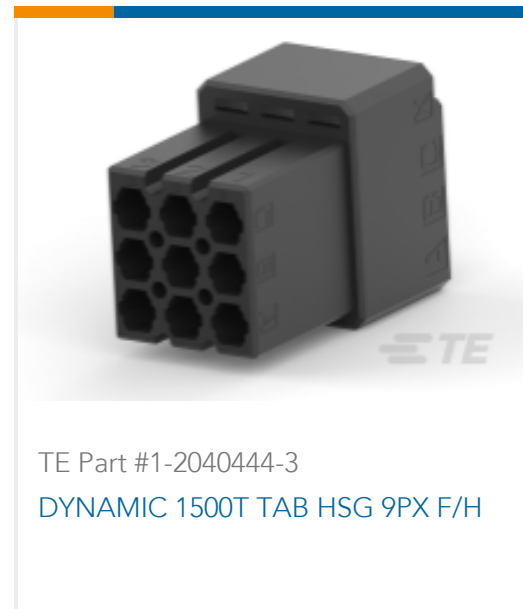
TE Part #1-2040444-3 DYNAMIC 1500T TAB HSG 9PX F/H