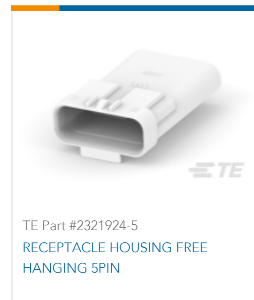
TE Part #2321924-5 RECEPTACLE HOUSING FREE HANGING 5PIN