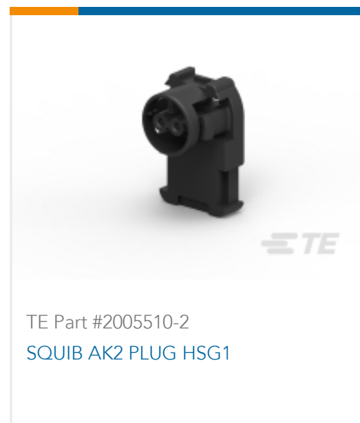
TE Part #2005510-2 SQUIB AK2 PLUG HSG1