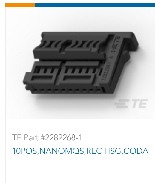
TE Part #2282268-1 10POS, NANOMQS, REC HSG, CODA