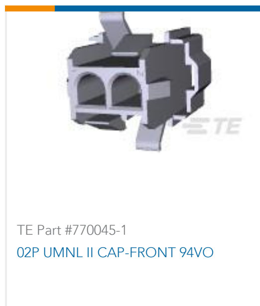
TE Part #770045-1 02P UMNL II CAP-FRONT 94VO