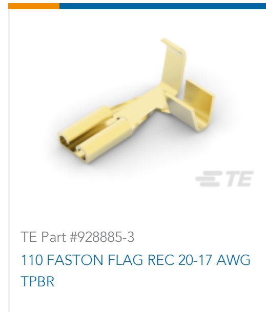
TE Part #928885-3 110 FASTON FLAG REC 20-17 AWG TPBR