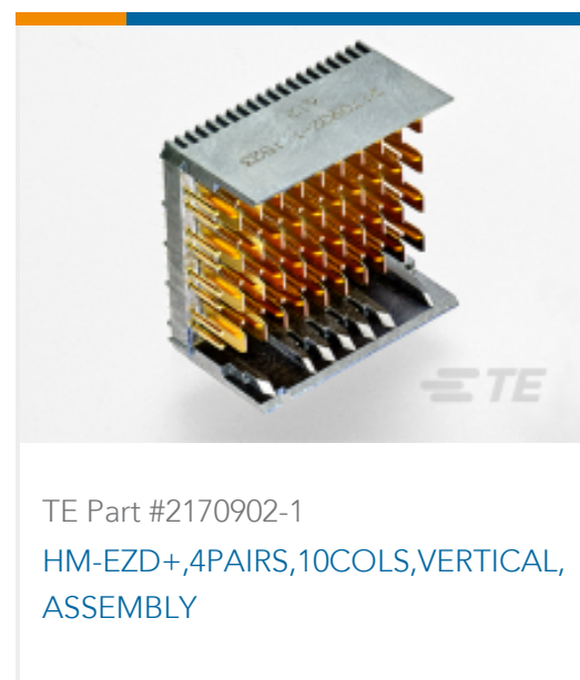
TE Part #2170902-1 HM-EZD+, 4PAIRS, 10COLS, VERTICAL, ASSEMBLY