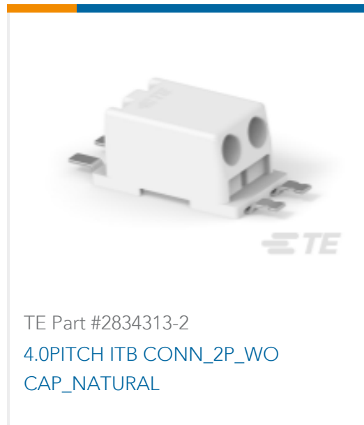
TE Part #2834313-2 4.0PITCH ITB CONN_2P_WO CAP_NATURAL