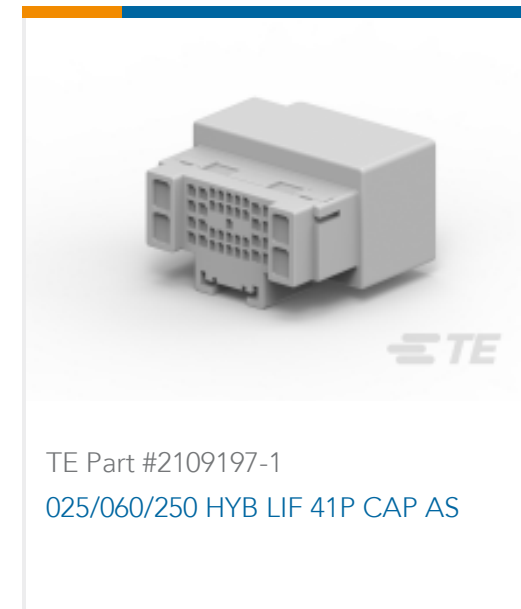
TE Part #2109197-1 025/060/250 HYB LIF 41P CAP AS