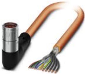
Cable plug in molded plastic, Length: 5 m, Color of outer sheath: orange RAL 2003

Please be informed that the data shown in this PDF Document is generated from our Online Catalog. Please find the complete data in the user's documentation. Our General Terms of Use for Downloads are valid ( http://phoenixcontact.com/download )