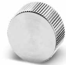
Metal protection cap for signal connectors with M23 external thread

https://www.phoenixcontact.com/au/products/1604260