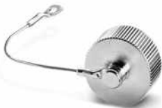
Metal protection cap with steel wire for signal connectors with M23 external thread

https://www.phoenixcontact.com/au/products/1604236