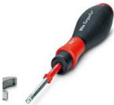
Torque screwdriver, series: RC

https://www.phoenixcontact.com/us/products/1607456