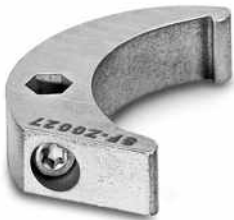
Hook wrench, series: RC

https://www.phoenixcontact.com/us/products/1607455