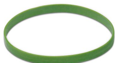
Color-coding, color: green

https://www.phoenixcontact.com/pc/products/1620588