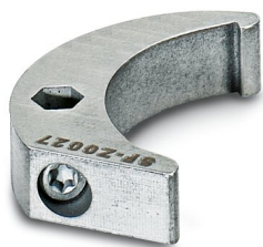
Hook wrench, series: RC

https://www.phoenixcontact.com/pc/products/1607455