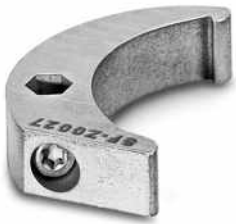
Hook wrench, series: RC

https://www.phoenixcontact.com/pc/products/1607455