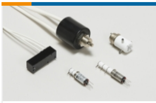
High Voltage Relays(18)