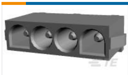
TE Part #350430-1 04P UMNL PIN HDR ASSY NATL