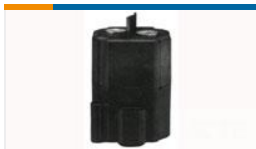
TE Part #2-1618002-6 EV250-2B=RELAY, 24VDC SPST-NO