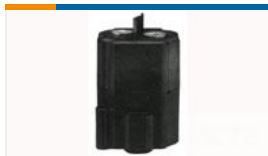
TE Part #2-1618002-3 EV250-1B=RELAY, SPST-NO