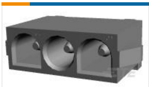
TE Part #350429-1 03P UMNL PIN HDR ASSY NATL