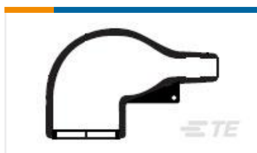
TE Part #903960-000 222K163-25/225-0