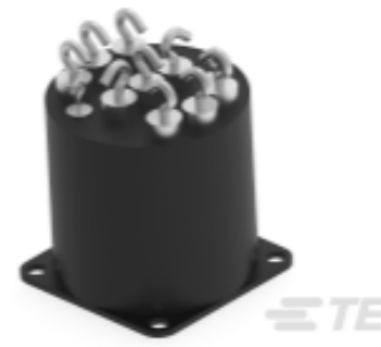
TE Part #1-1616037-2 AC Contactor: 3PDT,Solder Hook