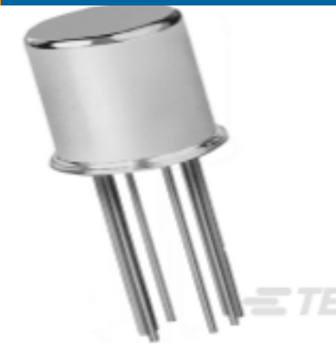
TE Part #1617162-8 J1MACT-26XP = M28776/5-030P