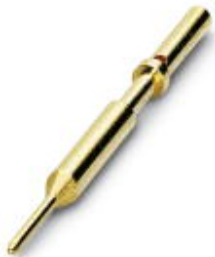
Crimp contact, turned, contact diameter: 0.6 mm, crimp range: 0.14 mm 2 ... 0.34 mm 2

Please be informed that the data shown in this PDF Document is generated from our Online Catalog. Please find the complete data in the user's documentation. Our General Terms of Use for Downloads are valid ( http://phoenixcontact.com/download )