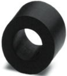
Fixed gasket, cable diameter range: 9.5 mm ... 11.5 mm

Please be informed that the data shown in this PDF Document is generated from our Online Catalog. Please find the complete data in the user's documentation. Our General Terms of Use for Downloads are valid ( http://phoenixcontact.com/download )