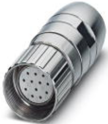
Cable connector, straight, shielded: yes, Screw locking, M23, No. of pos.: 12, type of contact: Socket, Solder connection

Please be informed that the data shown in this PDF Document is generated from our Online Catalog. Please find the complete data in the user's documentation. Our General Terms of Use for Downloads are valid ( http://phoenixcontact.com/download )