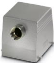
HEAVYCON sleeve housing B32, for double locking latch, height 80 mm, with support 1x M25, lateral conductor exit

Please be informed that the data shown in this PDF Document is generated from our Online Catalog. Please find the complete data in the user's documentation. Our General Terms of Use for Downloads are valid ( http://phoenixcontact.com/download )