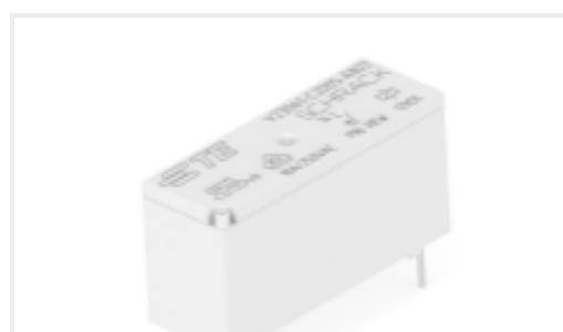
TE Part #5-1416200-0 V23061C2005A802