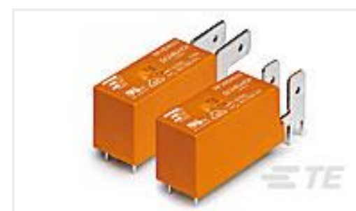
TE Part #5-1415520-1 RFH34012WG