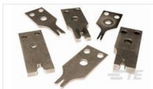
TE Part #1-854830-0 CRIMPER,INSULATION SP(.140 OV)