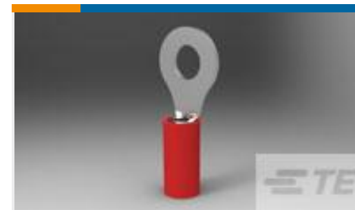
TE Part #31894 PIDG R 22-16 COMM 22-18MIL 1/4