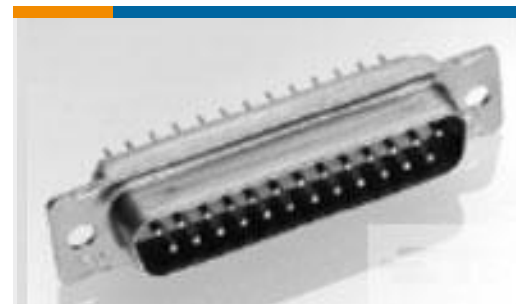
TE Part #1-1757823-2 AMPLIMITE,ASY,PLUG,STD,90,ZN,6,CT