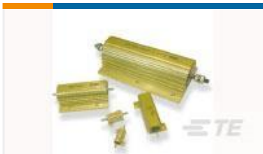
TE Part #1676814-5 HSA5 330R 1%