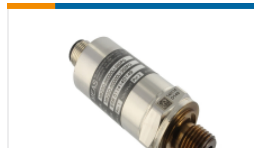
TE Part #M5254-000005-05KPG PRESS XDCR M5254-000005-05KPG