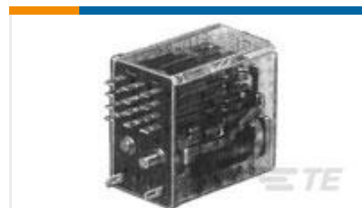
TE Part #1-1393766-9 R10-E1X4-24V=R10