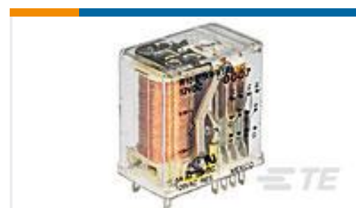
TE Part #1-1393767-5 R10-E2X2-V700=R10