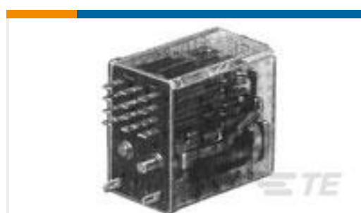
TE Part #1-1393766-9 R10-E1X4-24V=R10