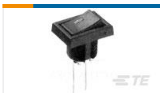
TE Part #5-1437595-2 TRD11F10WL=SUB MINI ROCKER BLA