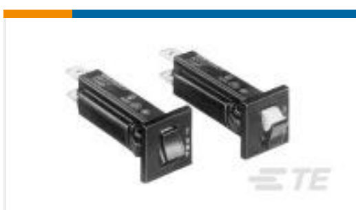
TE Part #2-1393250-3 W28-XQ1A-1=W28-