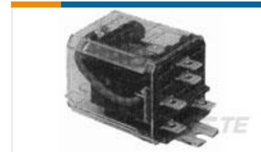
TE Part #6-1393114-9 KUHP-11A51-120=KU