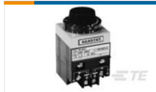
TE Part #2-1423164-2 7022PD=RLY,STD,OFF,2P,125VDC,5