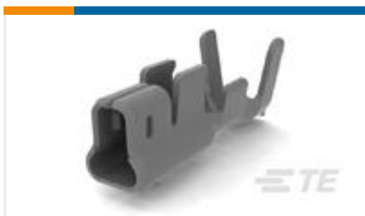
TE Part #2110989-1 EP 2.5 RCPT CONTACT, 26-22 AWG