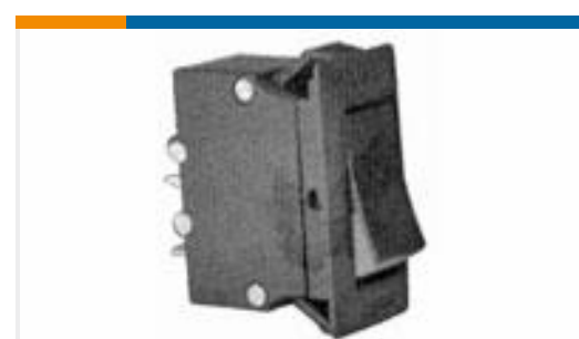
TE Part #3-1423673-9 W51-A152A1-5=CKTBKR,THERM,ROC