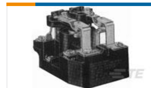
TE Part #2-1393127-9 PRD-11AY0-24=PRD