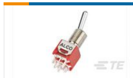
TE Part #2267079-2 TMS6T3B1M1QE