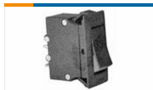
TE Part #1423673-7 W51-A121B1-20=CKTBKR,THERM,ROC