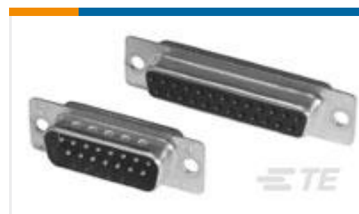
TE Part #5-747912-4 25 PLUG SOLDER CUP STD DUPL, R