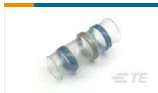
TE Part #114163-000 CWT-9003