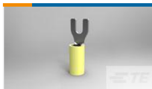
TE Part #32588 TERMINAL,PIDG SPD 12-10 8