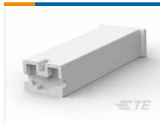
TE Model / Part #928083-1 PL 187 REC HSG 1P NYLON NAT