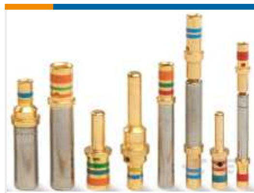
TE Model / Part #ZPF000000000001930 182-0118-20